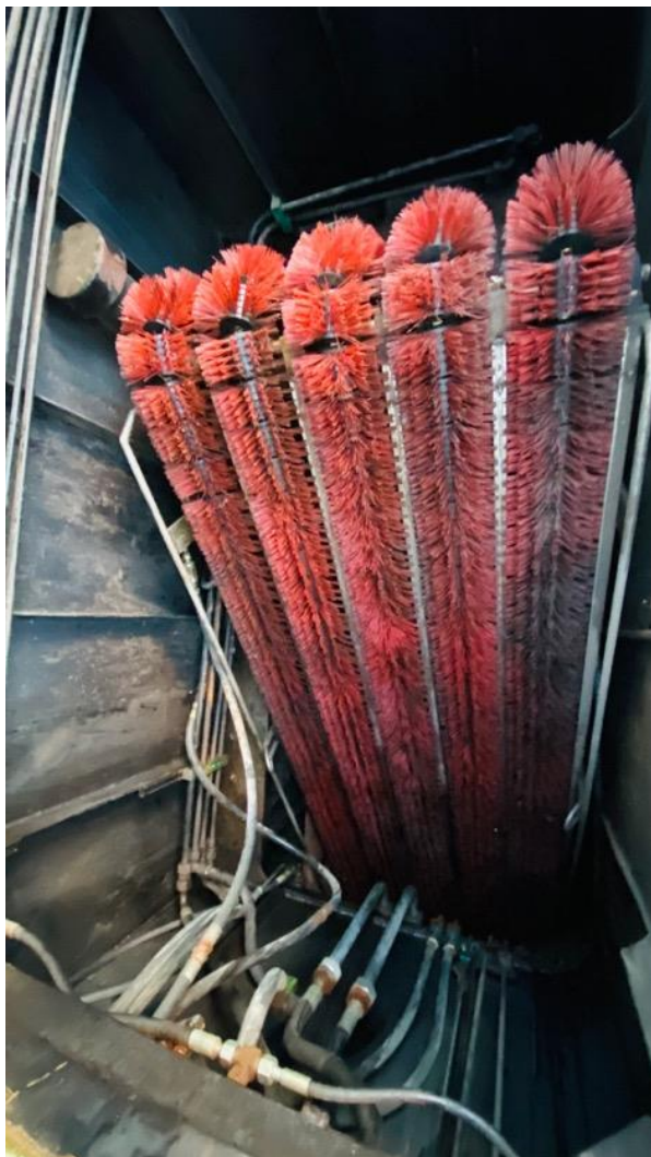
OIL RECOVERY BELT SKIMMER (PS SIDE)