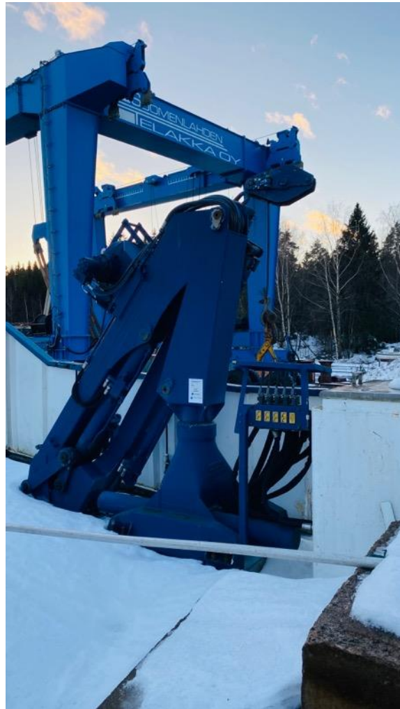
STBD DECK CRANE