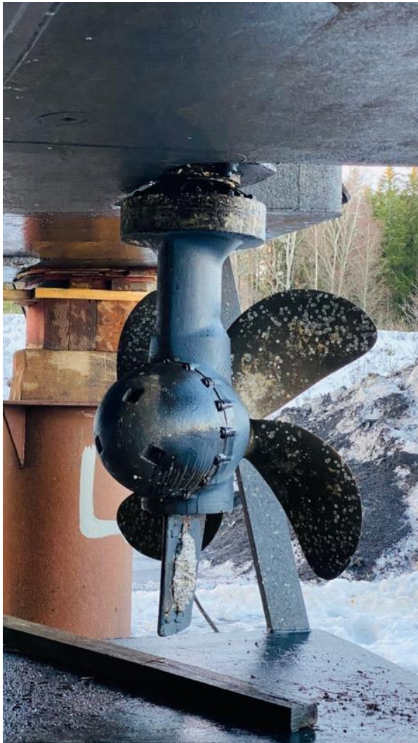
360 TURING POD