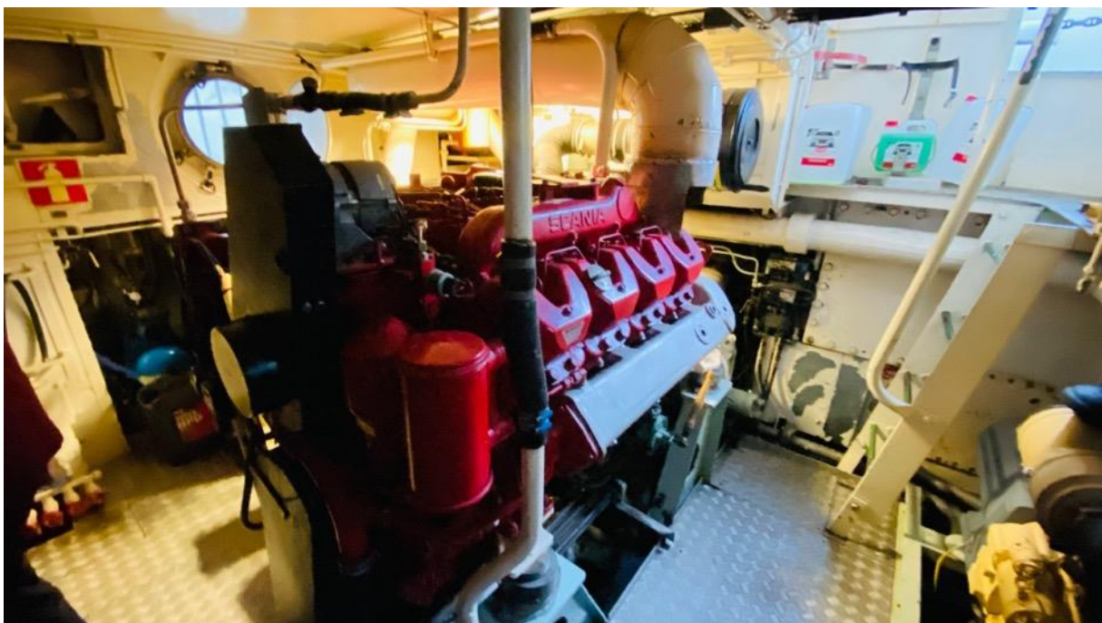
CLEAN AND WELL MAINTAINED ENGINE ROOM