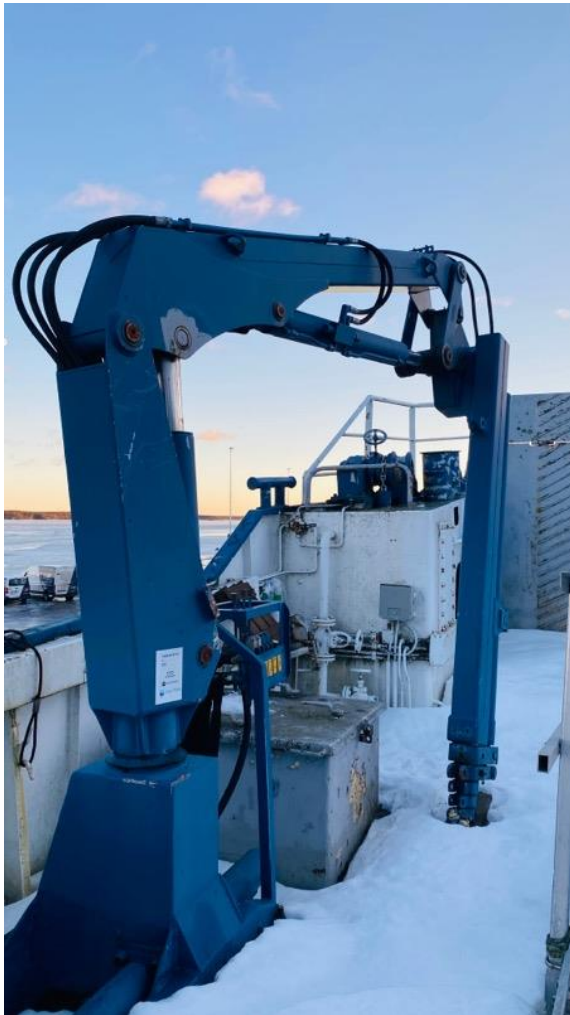
PORT DECK CRANE