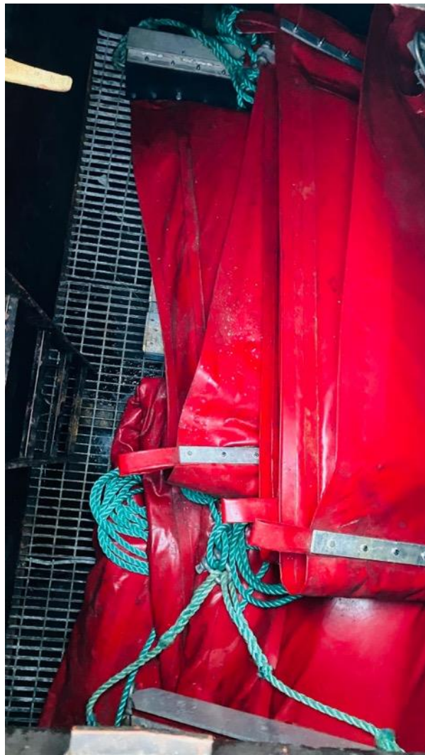
OIL RECOVERY EQUIPMENT