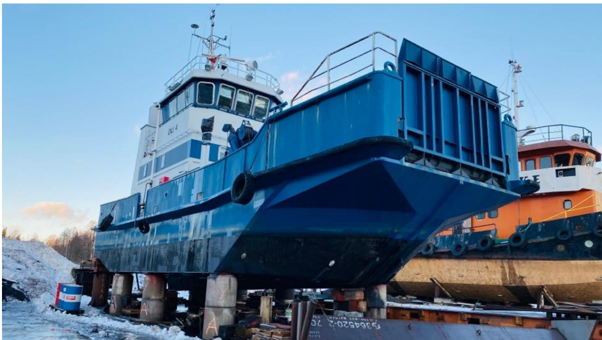
Photos from DD 19.dec 2023